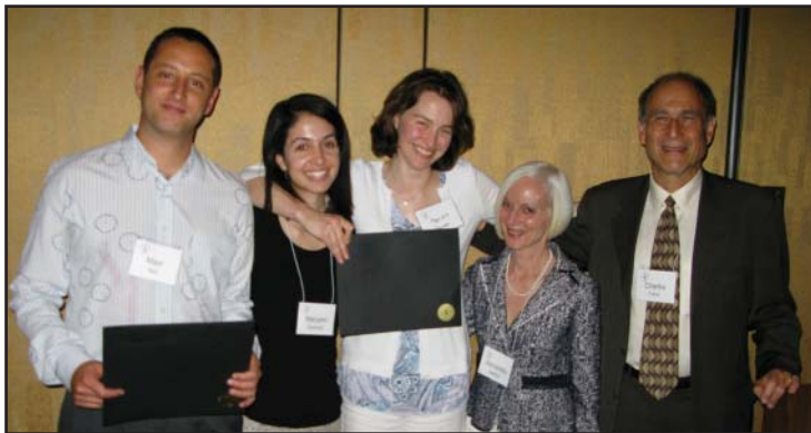
Presentation of 2009 Laughlin Fellows