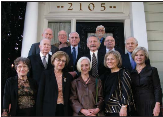
Board of Regents, May 2009