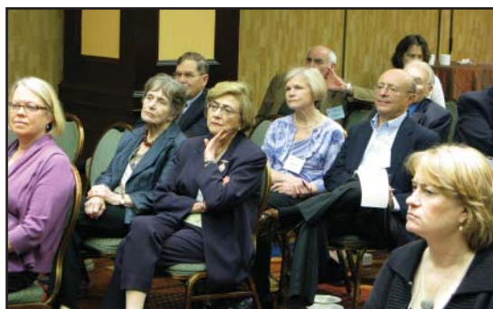
Scientific Program 2009