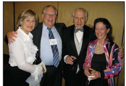
2009 Annual Awards Banquet